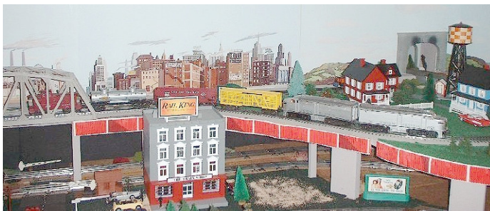
Peter Schuytema's 2023 UP set takes the high road