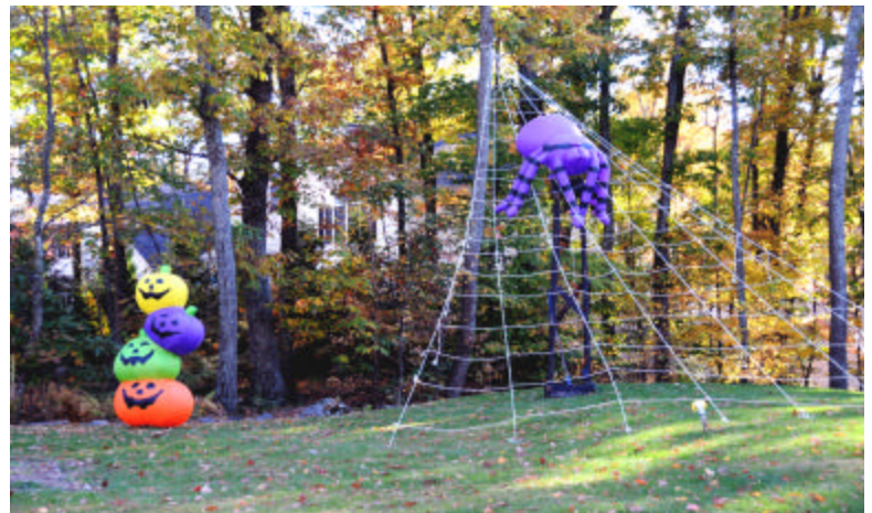
A big spider web and pumpkins in Stroudsburg, PA ready for Halloween.