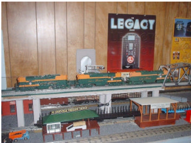
Terry Parker's trio of Great Northern power

There was another auction with a variety of really neat items offered at irresistible prices. Some of the trains in attendance were: