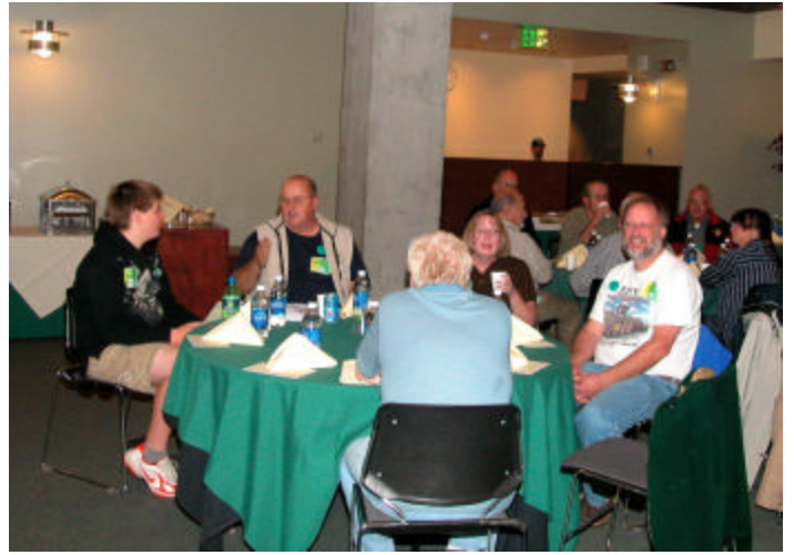
Above, groups of members all visiting at their tables prior to the luncheon.