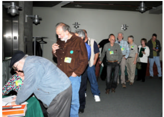
Check out that line up waiting to receive their cars