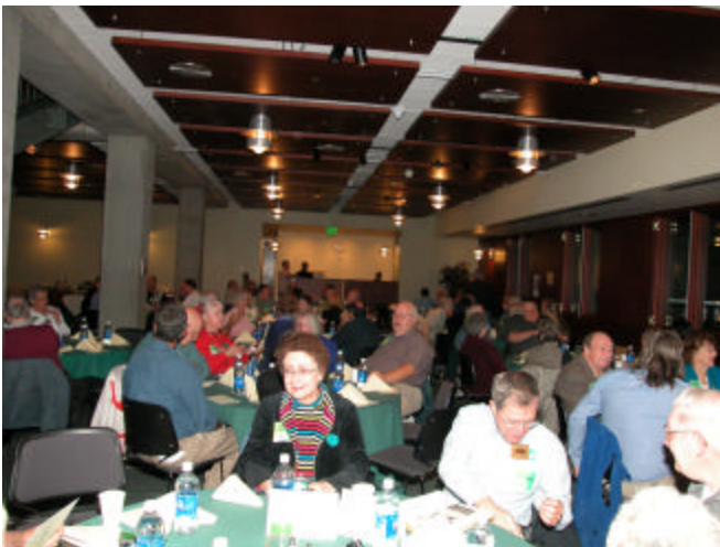
Another overview of the big room that we all enjoyed.